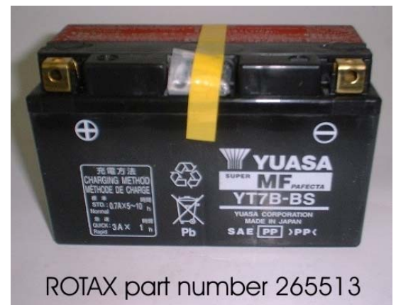
ROTAX part number 265513

(tabs should be mounted looking towards each other to allow to still use the standard cable harness 265550/2 as well as the adapter cable 266021)